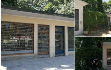
#Xyzvenezias Passeggiando per il viale principale, si incontrano questi due blocchi di edifici abbandonati. Essi una volta erano edifici commerciali, chiusi a partire dal 2004. Al momento non è in corso nessun progetto per recuperare questi luoghi abbandonati. Translated from Italian by Microsoft #Xyzvenezias walking through the main boulevard, you meet these two blocks of abandoned buildings. They were once commercial buildings, closed from 2004. At the moment no project is underway to recover these abandoned places.